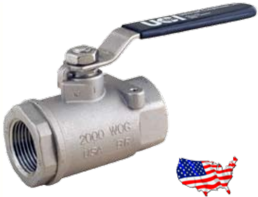
MSS SP-110 Compliant