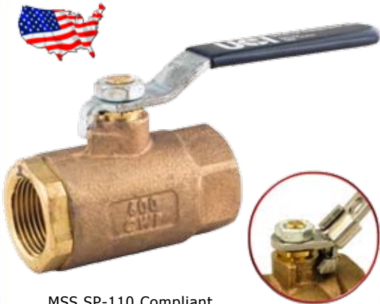
MSS SP-110 Compliant